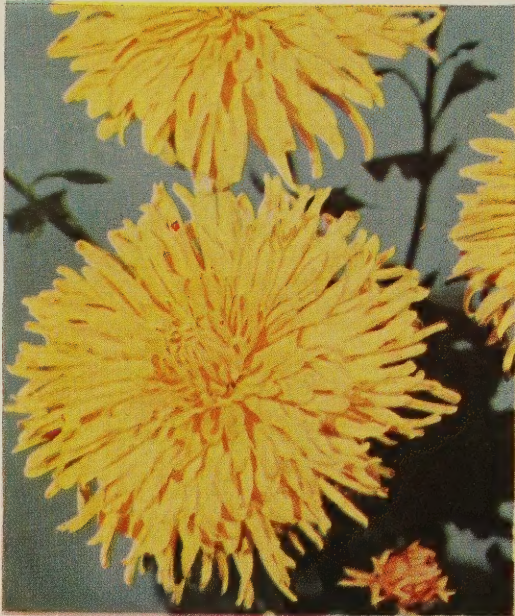
LEE POWELL. 60c each; 3 for $1.50